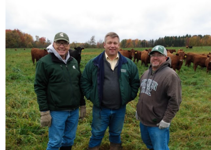
2021 Beginning Grazing School

MSU Extension serves the agriculture industry by engaging in research, education and outreach that enhances the quality of life of Michigan residents. In 2021, Gladwin County residents had the opportunity to participate in programming related to animal agriculture, agribusiness management, beekeeping, consumer and ornamental horticulture, and field crops, fruit crops, and vegetables.