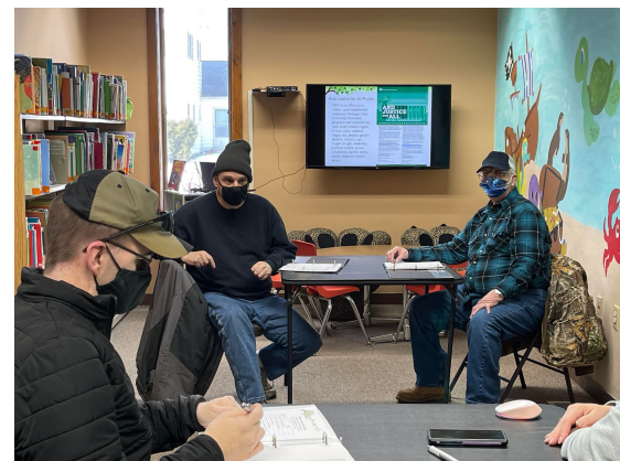
Mid-Michigan Industries (MMI) honored MSU Extension with their Community Partner of the Year Award.